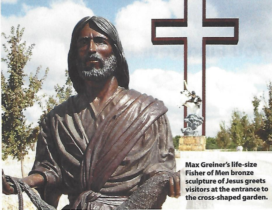
Max Greiner's life-size Fisher of Men bronze sculpture of Jesus greets visitors at the entrance to the cross-shaped garden.

When I planted the cross and claimed the land for God's kingdom, a three-inch scorpion charged the cross. Sherry crushed it with her foot just as my nephew Samuel yelled, "Look up in the sky!"